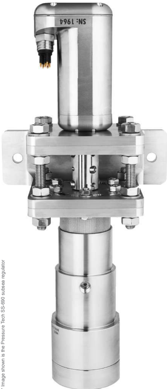
* Image shown is the Pressure Tech SS-690 subsea regulator