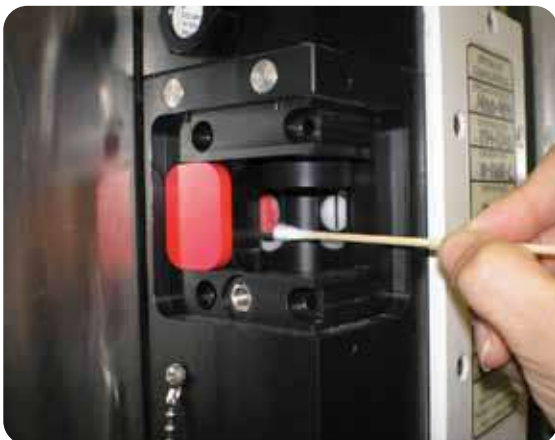
Easy cleaning reduces down time