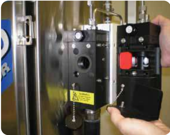
Direct replacement for all TD-4100XD flow cells in less than 5 minutes

Compatible with TD-4100 & TD-4100XD Oil In Water Monitors