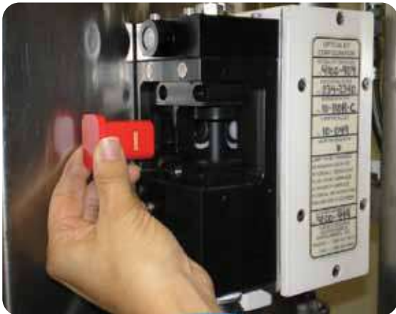
Simple Emission Filter removal from the front without any disassembly