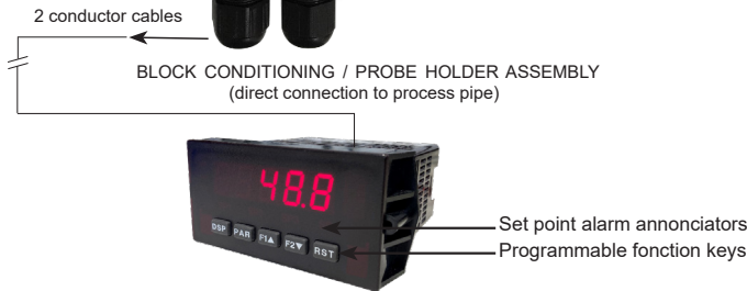
MOISTURE MONITOR PANEL CONTROL UNIT