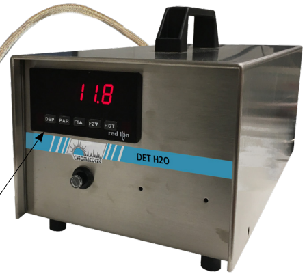
BATTERY OPERATED PORTABLE MOISTURE MONITOR